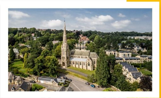
www.stjohnsranmoor.org.uk 0114 <mark>230 1199</mark>