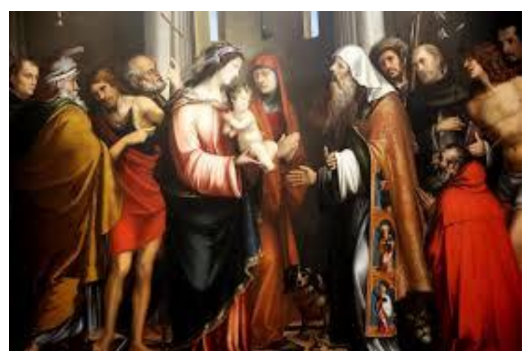
10.30am Parish Communion (On ZOOM and Facebook Live)